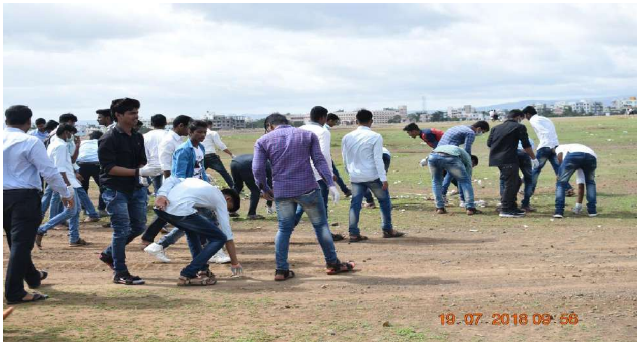
Fig.2) Students collecting garbage