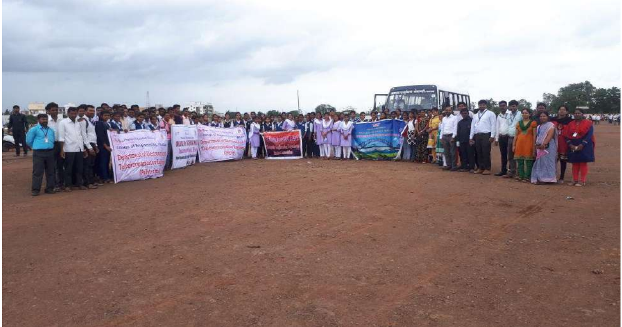
Fig.5) Students and Faculties from Mechanical, Civil and E & TC Department