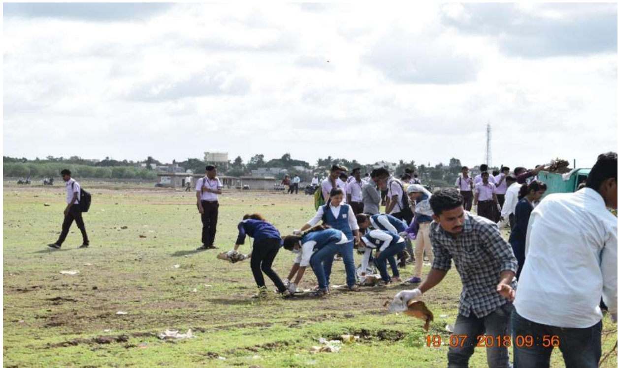
Fig.1) Students and faculties Cleaning at Palkhital

Here are some glimpses of cleaning activity.