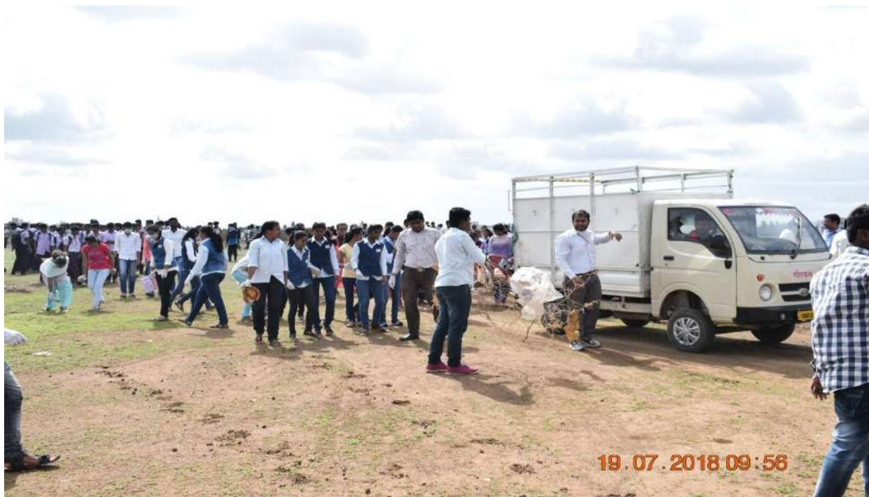
Fig.4) Students and Faculties collecting garbage