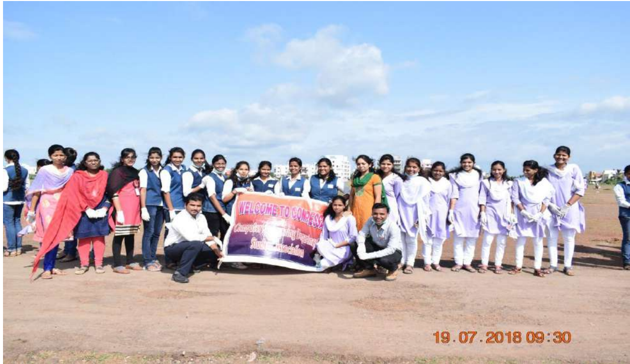
Fig.3) Students and Faculties at Palakhital cleaning (COMPESA)